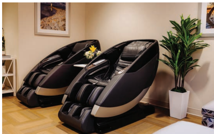
New massage chairs for ICU Caregiver Rejuvenation Room

process. The enhancements included new recliners for patient rooms, adjustable beds to assist patients with breathing, new patient lifts for the ICU rooms that did not yet have them and new chairs for the nurses' stations. Also included were renovations to the nursing lounges and conversion of an existing consultation room into a Critical Care Physician and Nurse Rejuvenation Room.