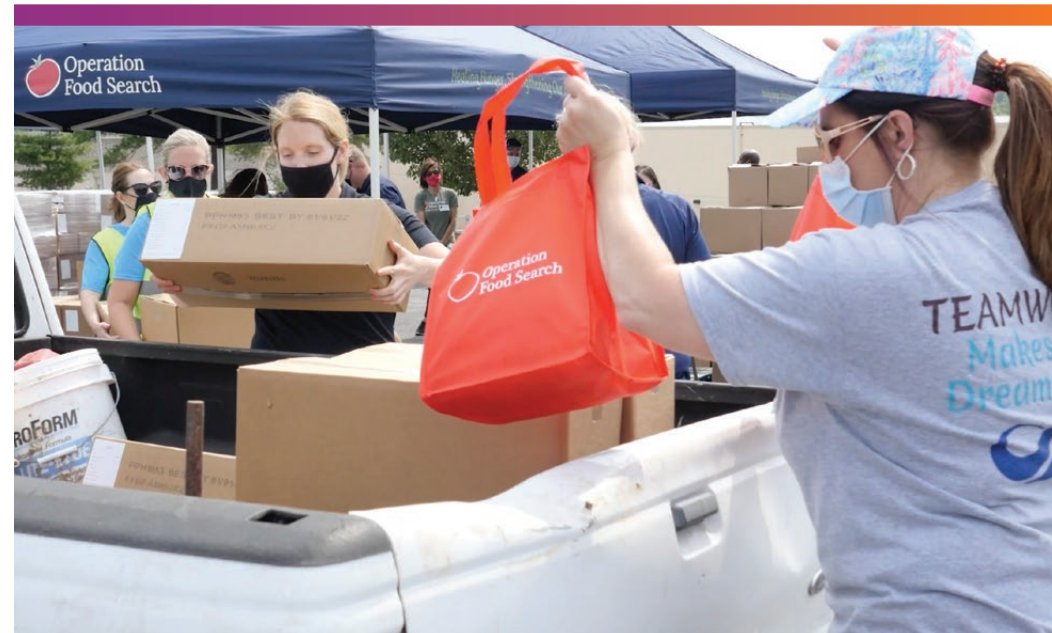
©2021 SSM Health Foundation - St. Louis. All rights reserved.

The project will create 16 new “roving” community care clinics and a Community Resource Center, place nurse practitioners at partner schools, food pantries, and shelters; extend telemedicine, multilingual outreach, and transportation support; help patients navigate Medicaid and health insurance; and connect residents with health care providers and community services. Free pop-up events such as the Community Health Fair will help reinforce the project’s goal of bringing health care to the community.