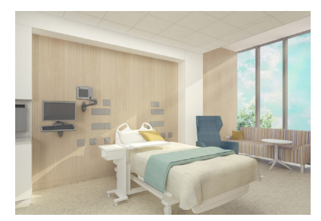
State-of-the-art patient rooms