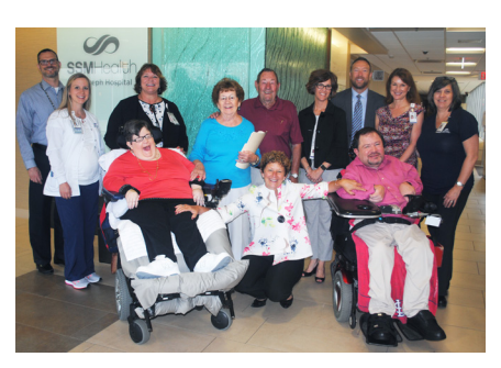
SSM Health St. Joseph Hospital - St. Charles ceiling lift celebration

— SSM Health St. Joseph Hospital - St. Charles and Lake Saint Louis, patient family member